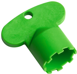
Service key Neoperl © Caché ©, TJ, 18 mm, green