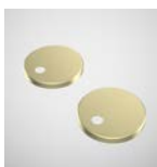
254213BB Brushed Brass