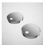
254213SS Stainless Steel